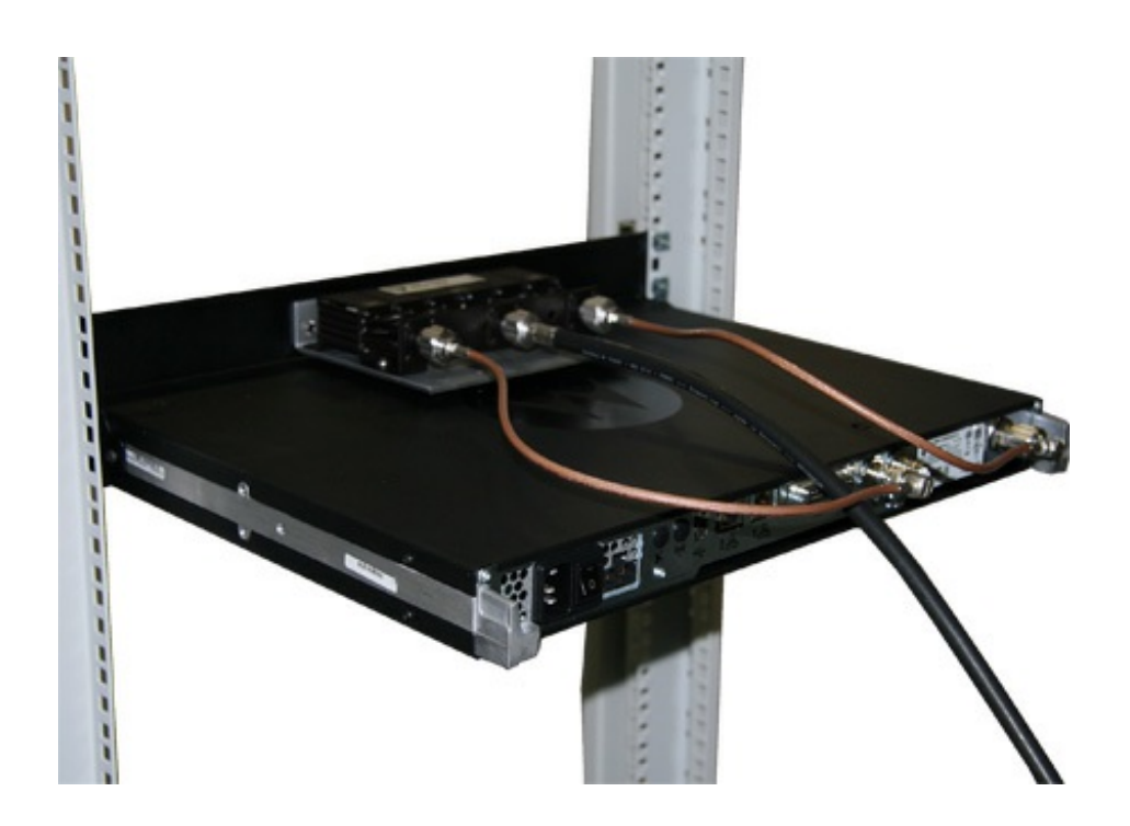
TX AND RX CABLES CAN BE SWITCHED TO HIGH OR LOW ON THE FILTER