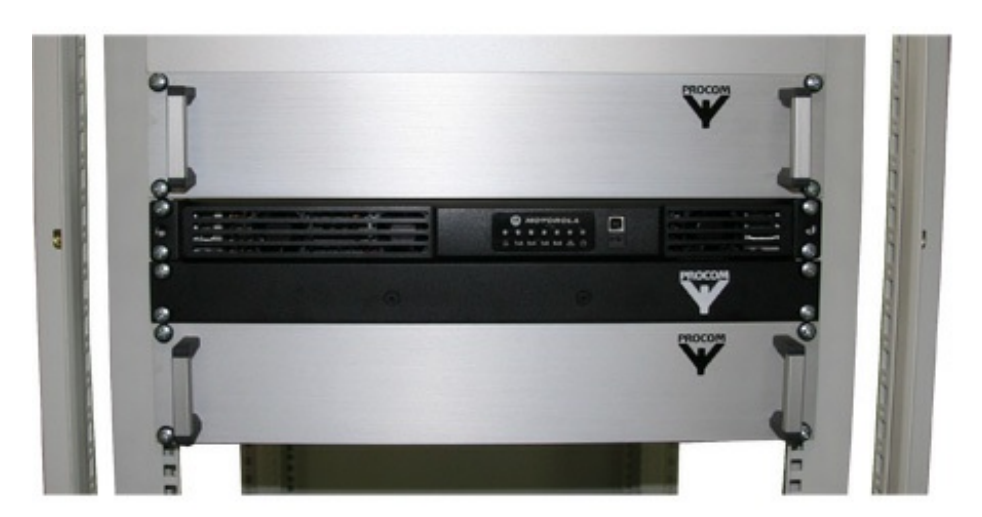
CAN BE CLOSED ABOVE OR BELOW THE REPEATER